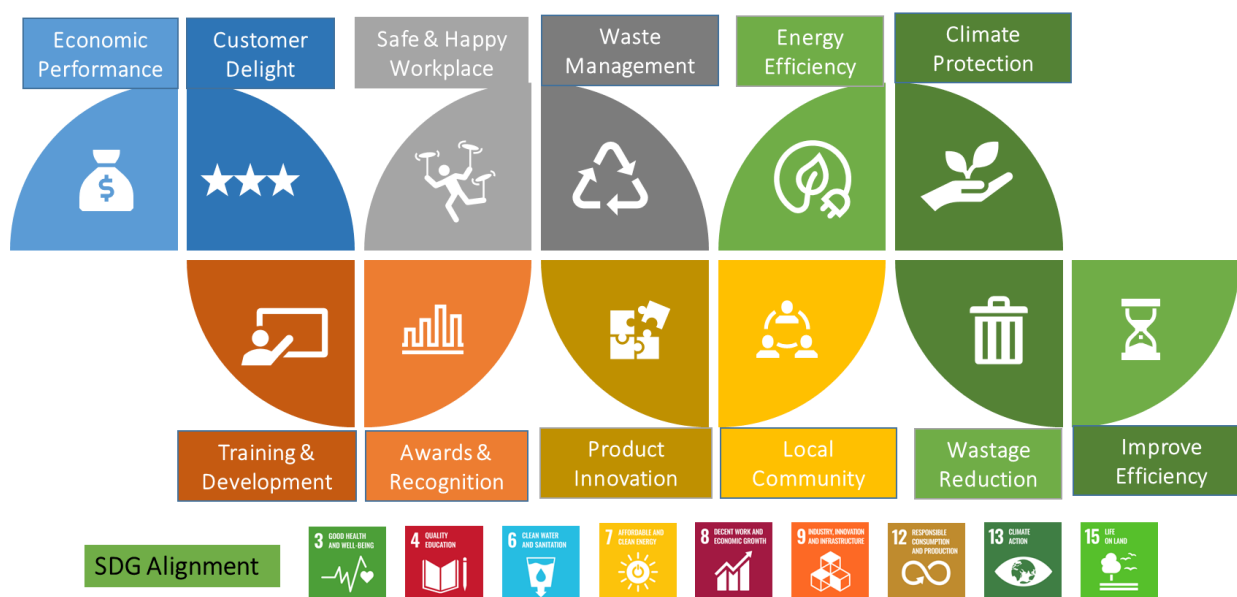
Figure 3: Material Issues