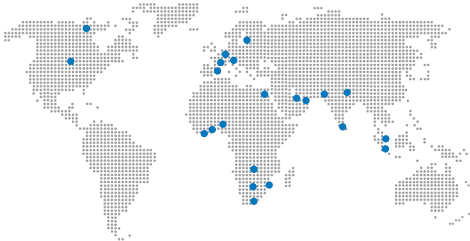
Figure 1: Global Markets We Serve

Our reputation precedes us as we proudly serve leading publishing houses globally. The stamp of quality is reinforced by our ISO 9001:2015 and ISO 14001:2015 certifications, reflecting our commitment to excellence, environmental stewardship, and ethical business practices. Additionally, our FSC: COC certification ensures responsible sourcing of materials.